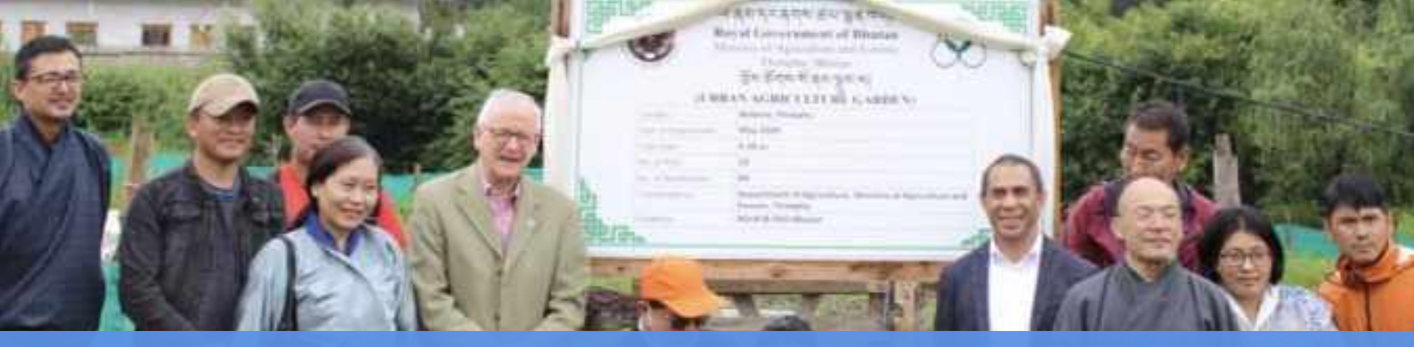
Photo: On 23 July, the UN Country Team visited the intensive vegetable production site under the Urban and Periurban Project organized by FAO Bhutan.