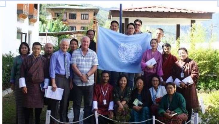
Security Wardens at the training