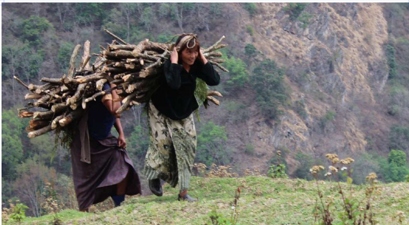
Rural women heading home after collecting firewood from the forest