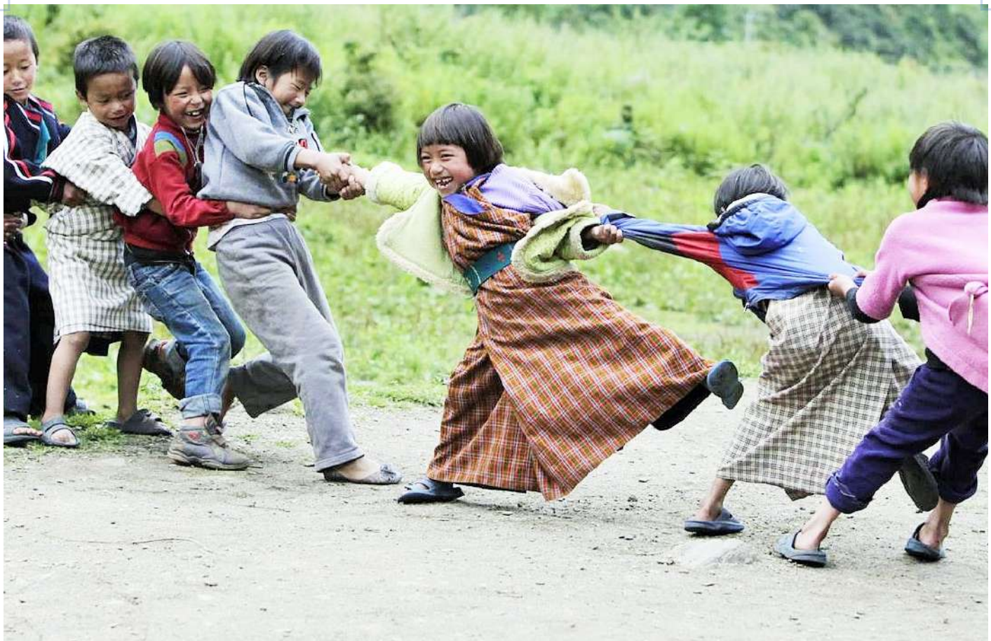
The health system in Bhutan is founded on the principles of Primary Health Care Approach