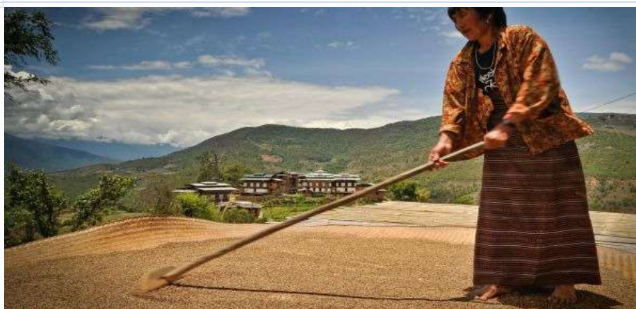
Rice constitutes 53% of daily dietary energy requirement for Bhutanese

United Nations Capital Development Fund (UNCDF) contributed directly to Outcome 1 through the assistance they provided to the RGoB towards preparing the technical foundation for securing long term assistance from the international green finance institutions. This assistance in partnership with the Korea Environment Institute and the Ministry of Home and Cultural Affairs focused on a climate resilience model identifying the climate change vulnerable regions in the country with the help of remote sensing data and field interviews. This will provide a strong platform for long term climate resilience planning. UNCDF also supported Bhutan's participation in the Local Adaptive Climate Living program which was instrumental in supporting local governments in developing and rolling out guidelines, supporting vulnerability assessments and local planning, and raising awareness.