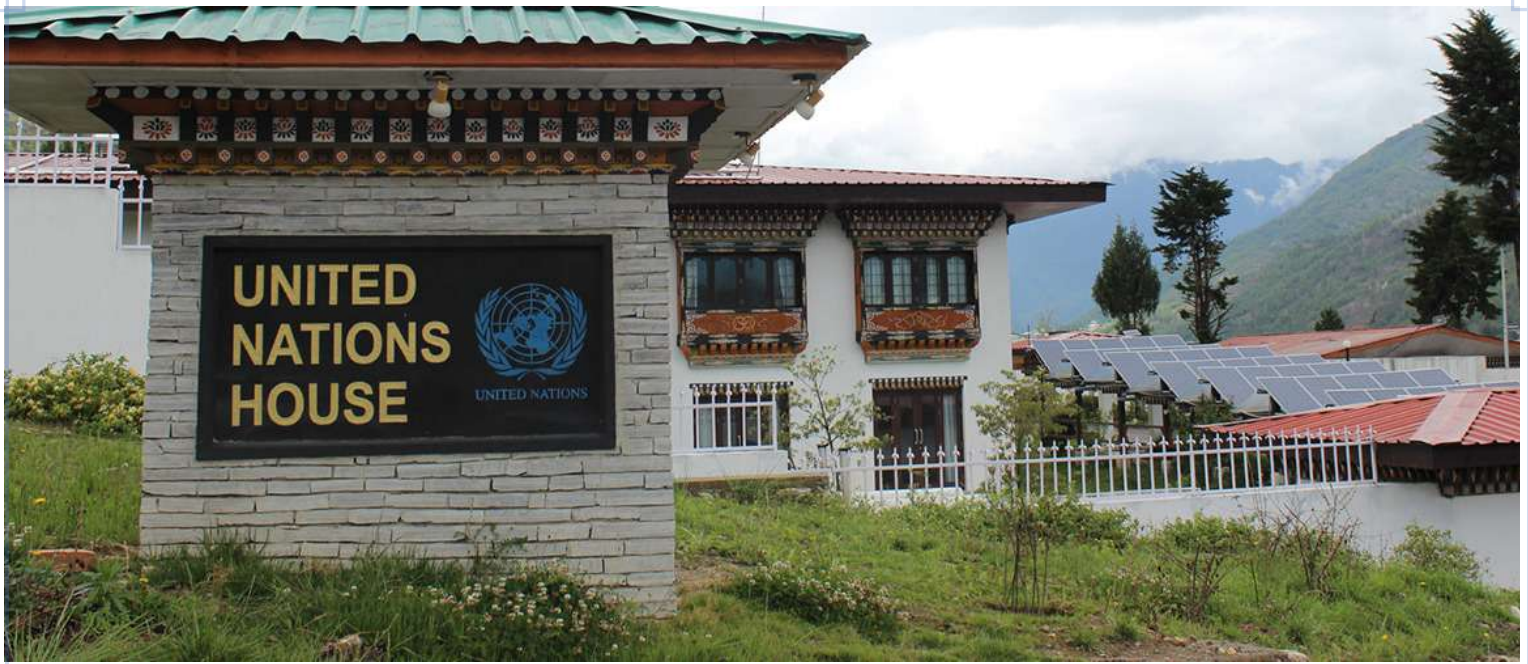
The United Nations House in Kawajangsa, Thimphu