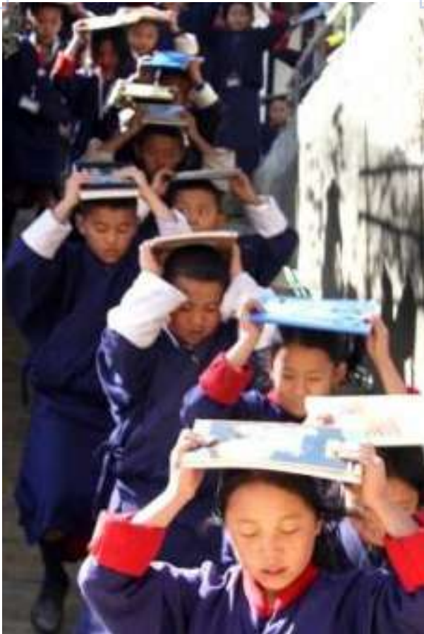
Students during an earthquake emergency preparedness simulation