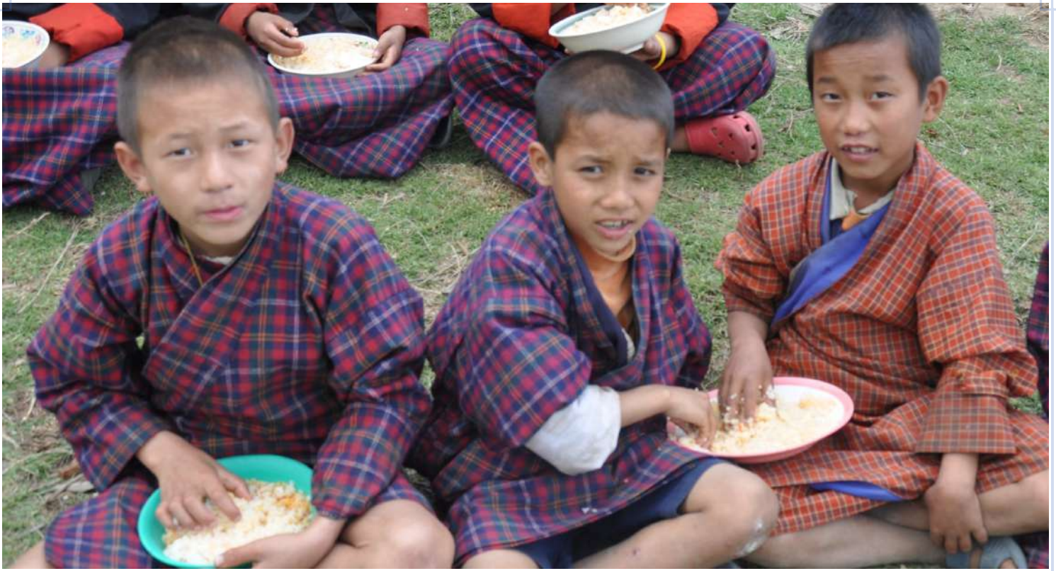
Students enjoying a happy meal through the School Feeding Programme

Management System (HIMS). District health information systems are now linked to the national HIMS. Through the training of key health workers in all the districts on the Minimum Initial Services Package, they are now better prepared to respond to emergencies. Emergency response has been further strengthened with improved ICT facilities.