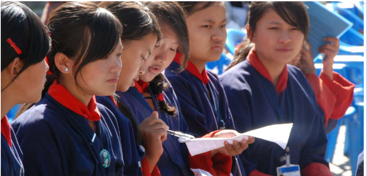
The youth have access to youth-friendly services to improve mental and physical health

An evidence-based practice on Gestational Diabetes Mellitus and Episiotomy through action research was generated which indicated the prevalence of Gestational Diabetes Mellitus in Bhutan.