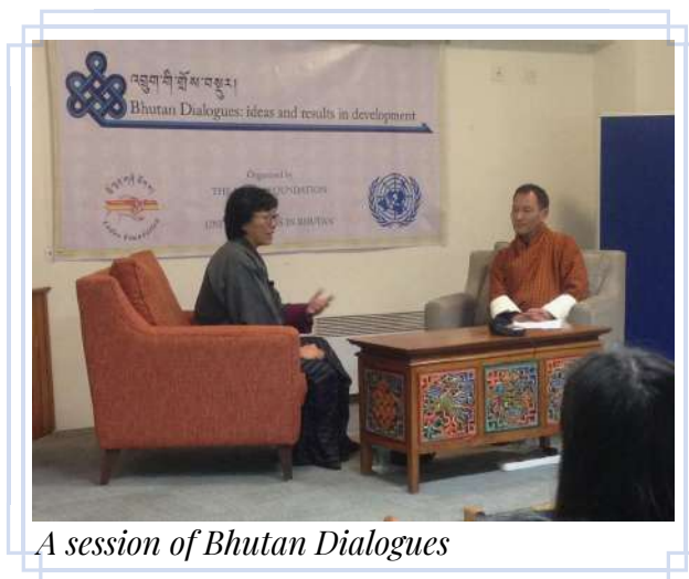
A session of Bhutan Dialogues