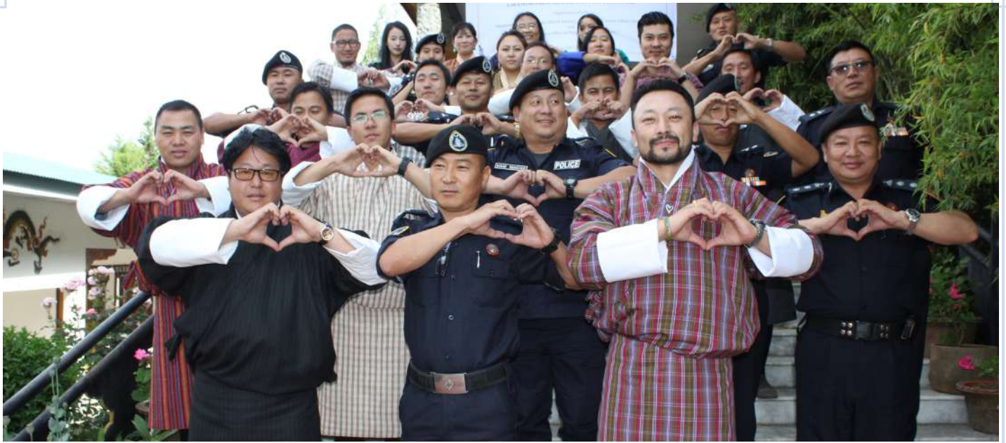
Government officials including police officers and prosecutors join hands against human trafficking with the UN

With UN support the Journalist Association of Bhutan improved its outreach to local communities regarding responsible social media engagement which included increased awareness of the opportunities and challenges of using social media platforms like Facebook and WeChat. The UN's support to develop the capacity of the Election Commission of Bhutan contributed to its ability to better facilitate electoral access for persons with disabilities, women with children, prisoners and sick people. The commission in the 2018 elections will provide postal ballots for persons with disabilities, priority for women with children, prisoners and people in the hospitals through polling stations in their localities.