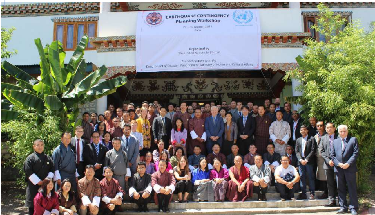
Participants at the Earthquake Contingency Planning Workshop