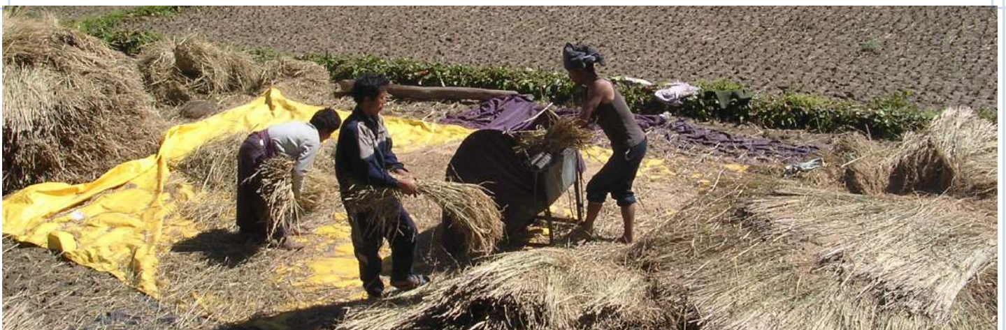
With 28% of cultivable land used for rice cultivation, Bhutan is 47% self-sufficient in rice

For the Montreal Protocol, UNEP contributed to a survey on the use of alternatives to Ozone Depleting Substances, the ratification of the Kigali Amendment, border dialogue between customs officials of Bhutan and India, training of customs and enforcement officers on trade control of Ozone Depleting Substances and the inauguration of the 'Ozone' park. For the Poverty-Environment Initiative, support was provided through Assessments on fiscal decentralization, main streaming reference groups and the institutionalization of gender, environment, climate, disaster risk reduction and poverty mainstreaming and the Strategic Environmental Assessment of Thimphu City's Master