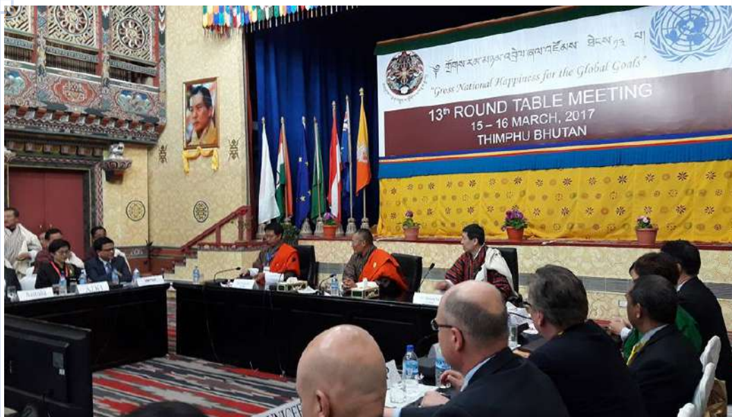
The Prime Minister, Foreign Minister and the UNDP Regional Director Chair the Round Table Meeting in 2017