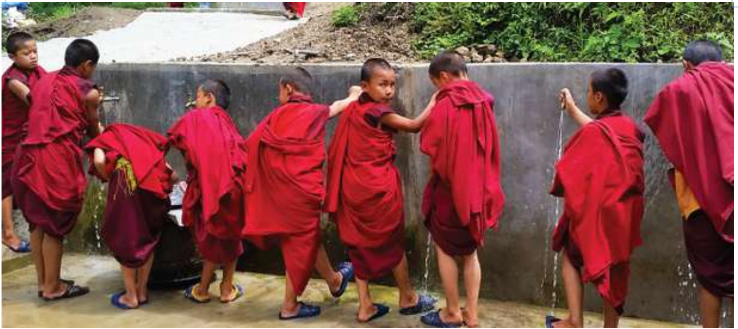
Young monks making the best use of access to clean water