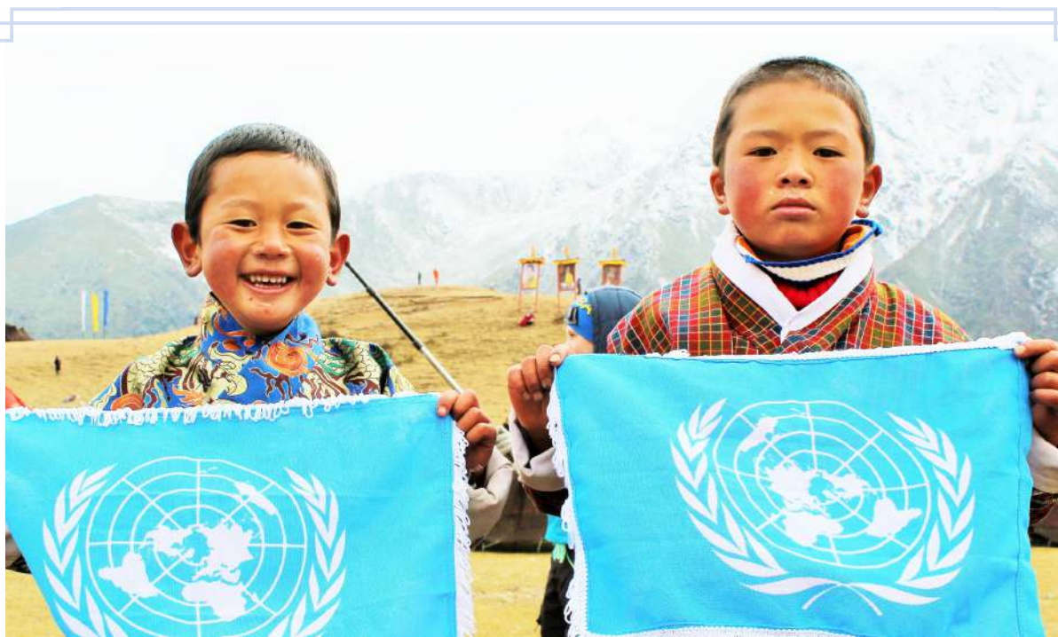
Two boys from Laya hold up UN flags