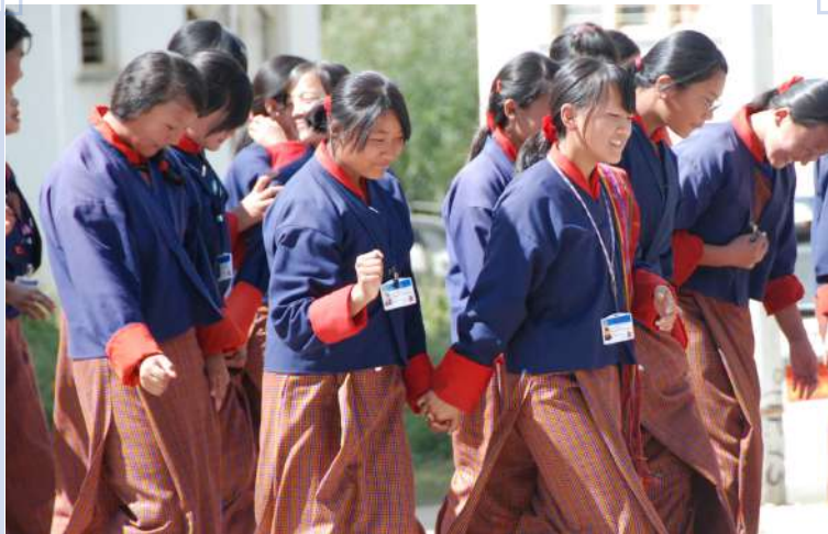
Bhutan achieved the MDG target for gender equality in school with progress in tertiary enrollment