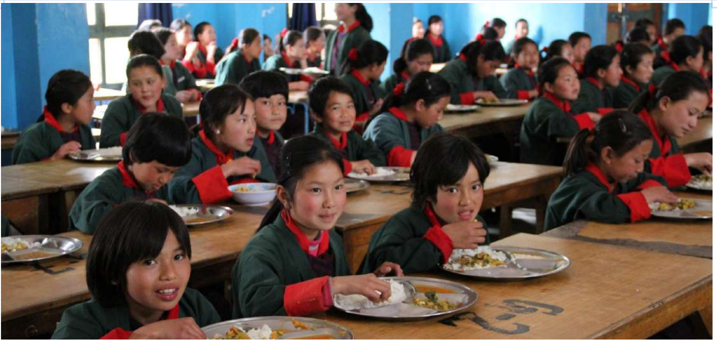
The school meal programme promotes school enrollment and attendance