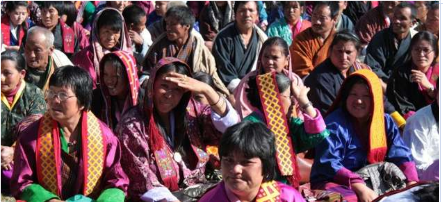
Women and men attending a community Zomdu (meeting)

Sustainable Development Partnership Framework' (UNSDPF). After the completion of the UNDAF milestone planner formulation at the beginning of 2017, an UNDAF One Programme (2014-2018) evaluation was initiated and the CCA was conducted. In September 2017, a CCA Validation Meeting was held with the RGoB and other national stakeholders. A Strategic Prioritization Workshop (SPW) was held in November 2017 with the participation of UN resident and non-resident agencies, the RGoB, development partners, CSOs and the media. After the SPW, the UNCT prepared a causality analysis for each of the development priorities identified during the SPW. A Theory of Change (ToC) Workshop took place in November 2017, with facilitation support from the UNICEF Regional Office for South Asia (ROSA), (Chief, Regional Programme and Planning and M&E Specialist) and UNDP technical support (Planning and Results). Following the SPW and ToC exercise, drafting of the UNSDPF began. As per the UNSDPF Milestone Planner, the UNSDPF was