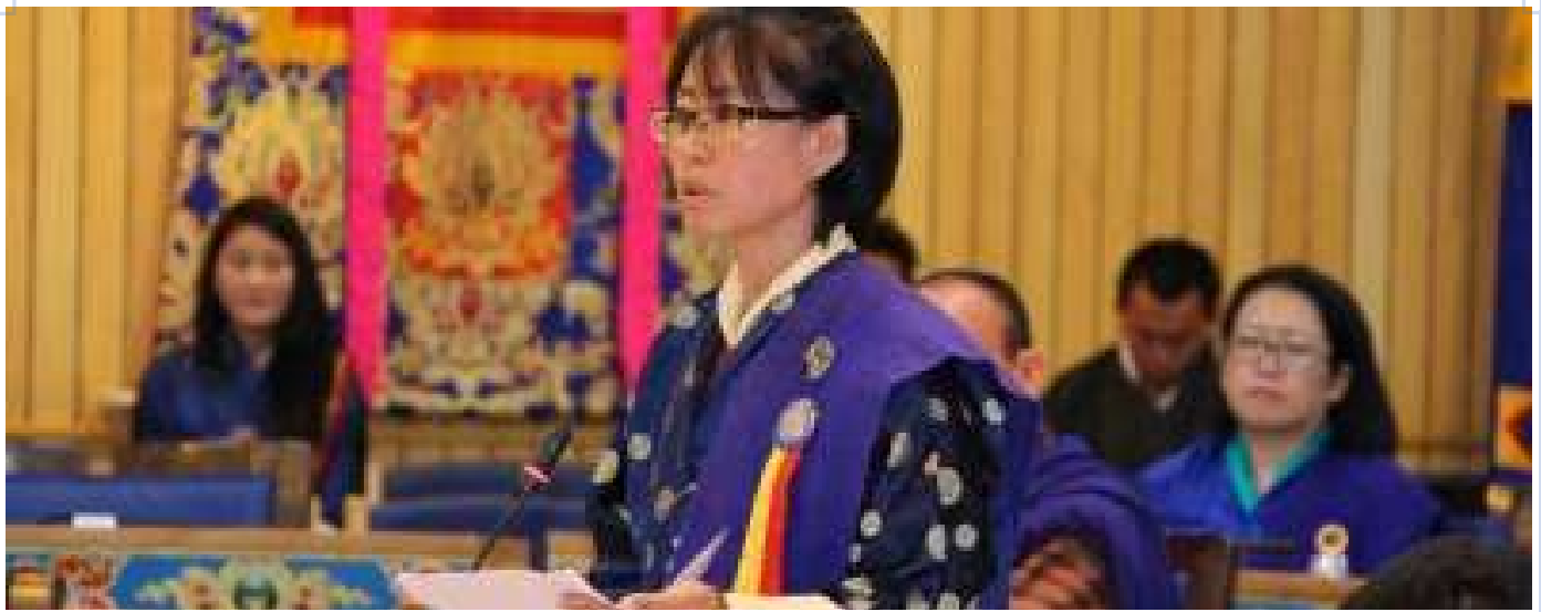
An Eminent member of the National Council, Tashi Wangmo, at a National Council session