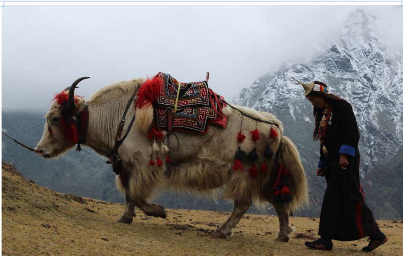
A highland woman takes her Yak back home after the annual Highland Festival in Laya