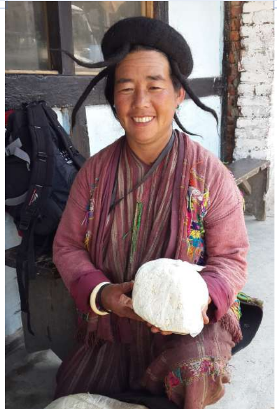
A Brokpa from Merak sells dairy products in Trashigang

To mainstream gender in key ministries, autonomous bodies, non-governmental organizations, the United Nations provided training to Gender Expert Groups across all sectors to mainstream gender in their respective sectors.